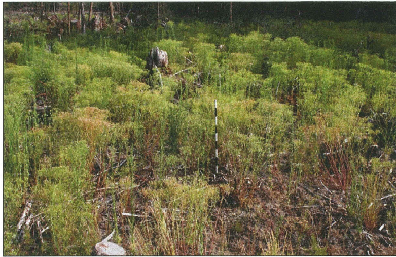
Figure 4. Early-successional communities are often dominated by annual herbaceous species for the first few years after disturbance; these are quickly displaced by perennial herbaceous species and shrubs.

Small mammal communities in ESFEs typically show high levels of diversity as well, including some obvious habitat specialists. The eastern chestnut mouse ( Pseudomys gracilicaudatus ), for example, inhabits early-successional environments in coastal eastern Australia for 2-5 years after a wildfire, and then declines dramatically until these environments are burned again (Fox 1990). Populations of mesopredators (medium-sized predators, such as raccoons [ Procyon lotor ] and fox species) benefit from the abundance of small vertebrate prey items characteristic of ESFEs. Likewise, some species