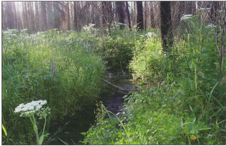
Figure 6. Streams within early-successional forest ecosystems contrast with forest-dominated reaches in many ecosystem attributes, including physical parameters (temperature and insolation), structure, plant and animal composition, and ecosystem processes, such as primary productivity.

Rates and patterns of geomorphic processes, such as erosion and nutrient leaching losses, are also different between ESFEs and later successional stages. Tree death results in a loss of root strength that is critical for stabilizing soils and deeper rock layers on mountain slopes (Perry et al. 2008). Erosion and landslides may occur at higher rates in ESFEs, contributing to the variability of sediment budgets in watersheds (Reeves et al. 1995) and creating long-lasting substrates for ruderals. While enhancing erosion processes, ESFEs also provide materials and processes that counteract this effect, such as woody debris, which retain sediments and organic materials, and surviving vegetation, which stabilizes slopes and nutrient stores (eg Bormann and Likens 1979).