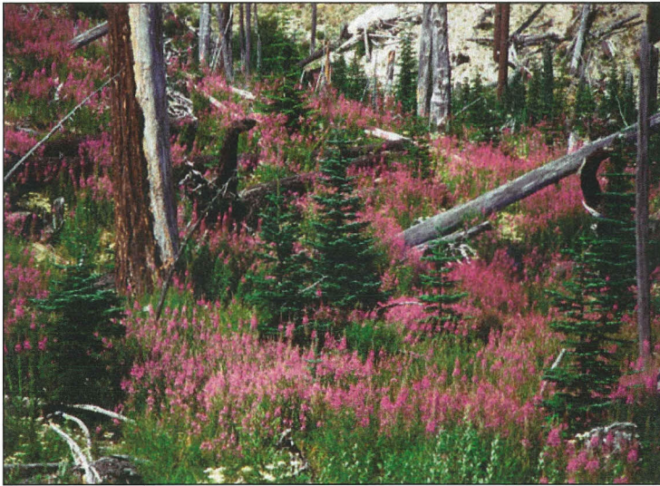
Figure 3. Plant communities with well-developed shrub and perennial herb species are characteristic of early-successional communities on forest sites and provide diverse food resources. Twenty-five years after the Mount St Helens eruption in 1980, this community, which was within the blast zone, includes well-developed shrubs (eg Sorbus and Vaccinium spp), trees, and perennial herbs (eg Epilobium angustifolium ).

Structural complexity is further enhanced by the establishment and development of a variety of plant species, which often include perennial herbs and shrubs characteristic of open environments, as well as individual trees (Figure 3). The diversity of plant morphologies (maximum height, crown width, etc) increases structural richness, so that this associated flora contributes to both horizontal and vertical heterogeneity.