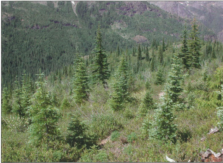
Figure 1. Stand-replacement disturbance events in forests create large areas free of tree dominance and rich in physical and biological resources, including legacies of the pre-disturbance ecosystem.