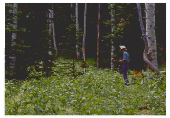
Figure 1.—A seral aspen community in northern Utah rapidly being replaced by Engelmann spruce and subalpine fir climax forest.

There have been only a few, geographically narrow attempts to classify aspen communities into recognizable associations based upon floristics and/or environment. Although interest in classifying aspen communities is increasing (Hoffman and Alexander 1980,