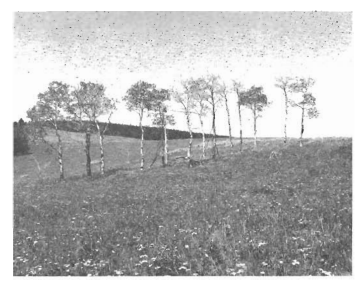
Figure 3.—A degenerating aspen community in southern Montana being replaced by mountain grassland vegetation.

during gradual deterioration of the clones (Schier 1975a) (see the VEGETATIVE REGENERATION chapter). Regeneration also can fail because of animal use. Where suckering does occur in a decadent clone, continued heavy browsing by wildlife or livestock can prevent suckers from developing into trees and cause a gradual conversion to grasslands or shrublands. (See the ANIMAL IMPACTS chapter.)